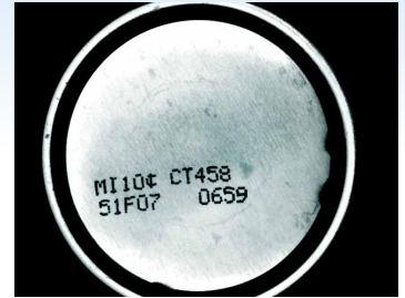
Acquired Solution Image

The concave, reflective surface of an aluminum can bottom creates a challenge for an OCR inspection. The DL2230 is well suited for this application, with an opening diameter slightly larger than the diameter of the can, and sufficient diffuse light to evenly illuminate the inkjet printed code without causing glare.