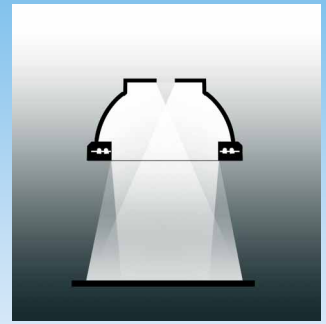
Light Function Diagram