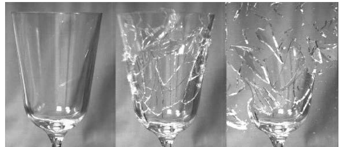
Figure 1. Camera Link is a popular interface for high-resolution and high-speed cameras.

Each NI PCIe-1430 includes one trigger line and two Camera Link connectors that work with any base configuration Camera Link camera. Additional I/O lines for advanced triggering, pulse-train outputs, and